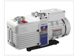
Rotary Vacuum Pump (Optional )